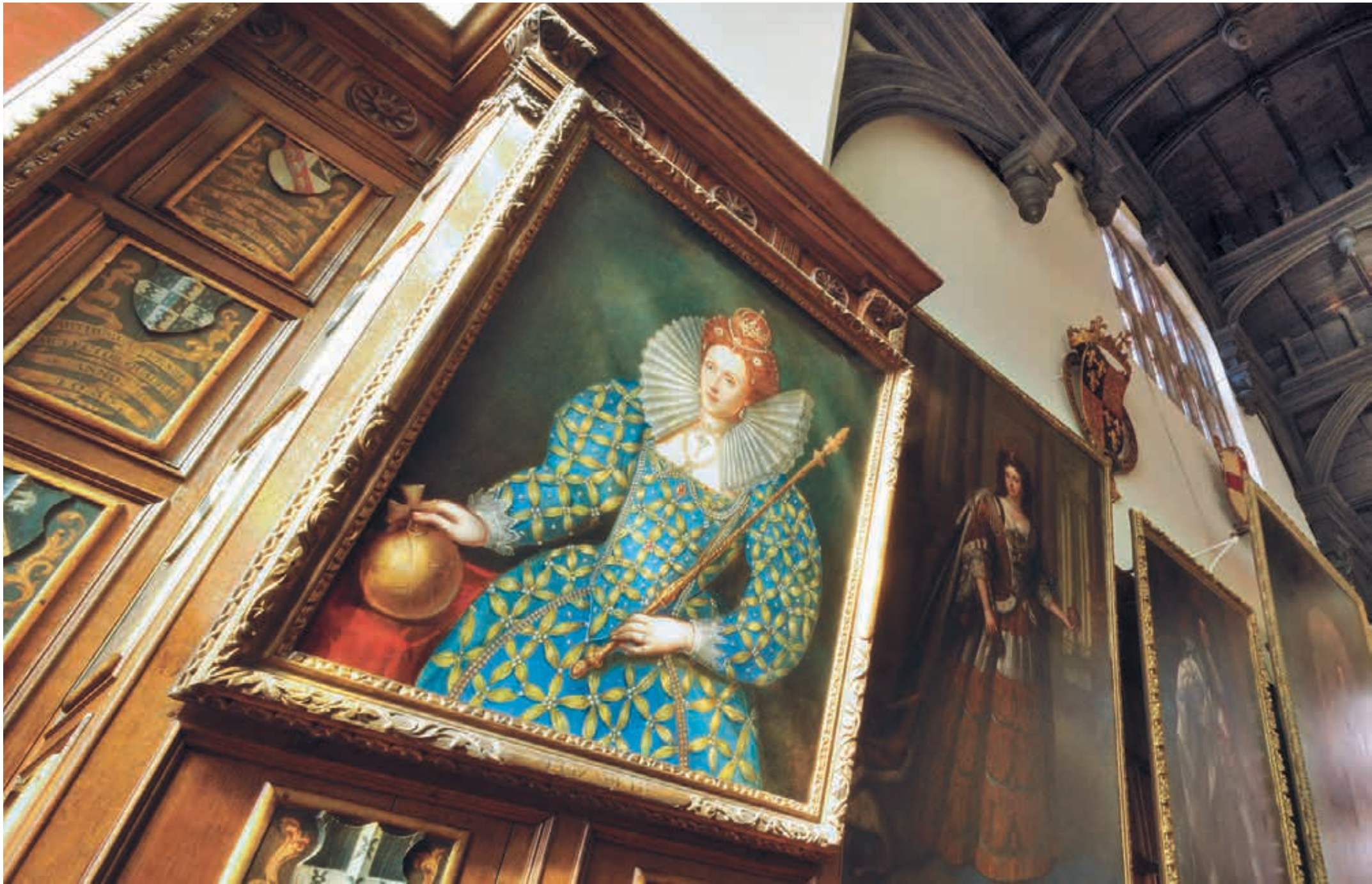
Middle Temple witnessed the very first recorded performance of 'Twelfth Night' on 2 February 1602. It is traditionally thought that Shakespeare and Queen Elizabeth attended this performance.